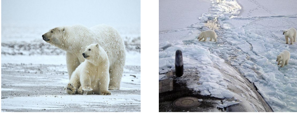
Figure 1 Two photos of polar bears. Left: Figure explanation; Right: Figure explanation (9pt)